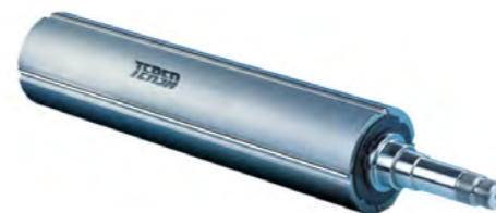
TERSA PLANER SHAFT