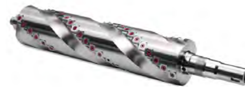
SPIRAL PLANER SHAFT